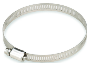
Round Member Adapter for 1–2 in round members